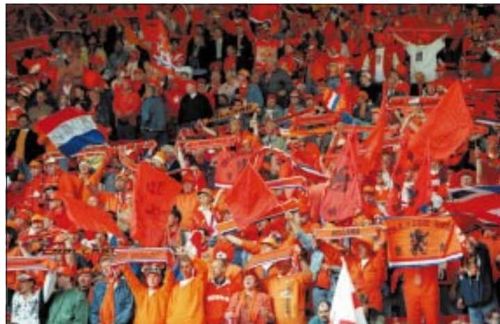
Was it the excitement, or was it the final score? The Netherlands-France match triggered excess cardiovascular events in Dutchmen—but not in women

The figure shows the number of deaths from all causes and myocardial infarction or stroke during 17-27 June 1996 for men and women separately. Mortality from all causes was increased in men on 22 June (173 v 150.1 cases; relative risk 1.15, 95% confidence interval 0.98 to 1.35) and lower in women (146 v 164.1 cases; relative risk 0.89, 0.75 to 1.06). In men, mortality from myocardial infarction or stroke was significantly increased (relative risk 1.51, 1.08 to 2.09) on the day of the football match (41 cases) compared with the five days on either side (on average 27.2 cases). Mortality from myocardial infarction and stroke in men was lowest