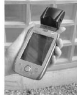
Personal Digital Assistant.

The application is build in ArcPAD Studio and you can run the application in the ArcPAD program. It is possible to put all the desired functions in the application.