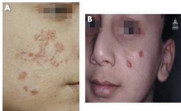
Figure 3 (A) Lupoid leishmaniasis with scarring due to previous L tropica infection and the presence of red/brown papules at the periphery of the scar. (B) Lupoid leishmaniasis with scarring due to previous L tropica infection, and two red/brown nodules at the superior and inferior poles, of the scar on the left cheek of a 9 year old boy from Afghanistan.