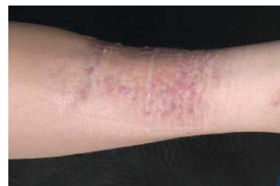
Figure 2 Complete clearing of lesions following local and systemic treatment with tacrolimus.

first reports of successful treatment of a child with pyoderma gangrenosum using tacrolimus.