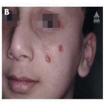
Figure 3 (A) Lupoid leishmaniasis with scarring due to previous L tropica infection and the presence of red/brown papules at the periphery of the scar. (B) Lupoid leishmaniasis with scarring due to previous L tropica infection, and two red/brown nodules at the superior and inferior poles, of the scar on the left cheek of a 9 year old boy from Afghanistan.