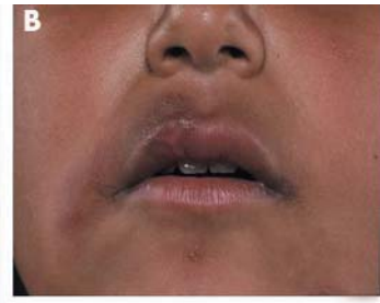
Figure 2 (A) A 3 year old boy from Turkey following treatment with systemic sodium stibogluconate. (B) An 8 year old girl from Pakistan, following treatment with systemic sodium stibogluconate.

addition, one of the children with lupoid leishmaniasis required surgical excision of two nodules.