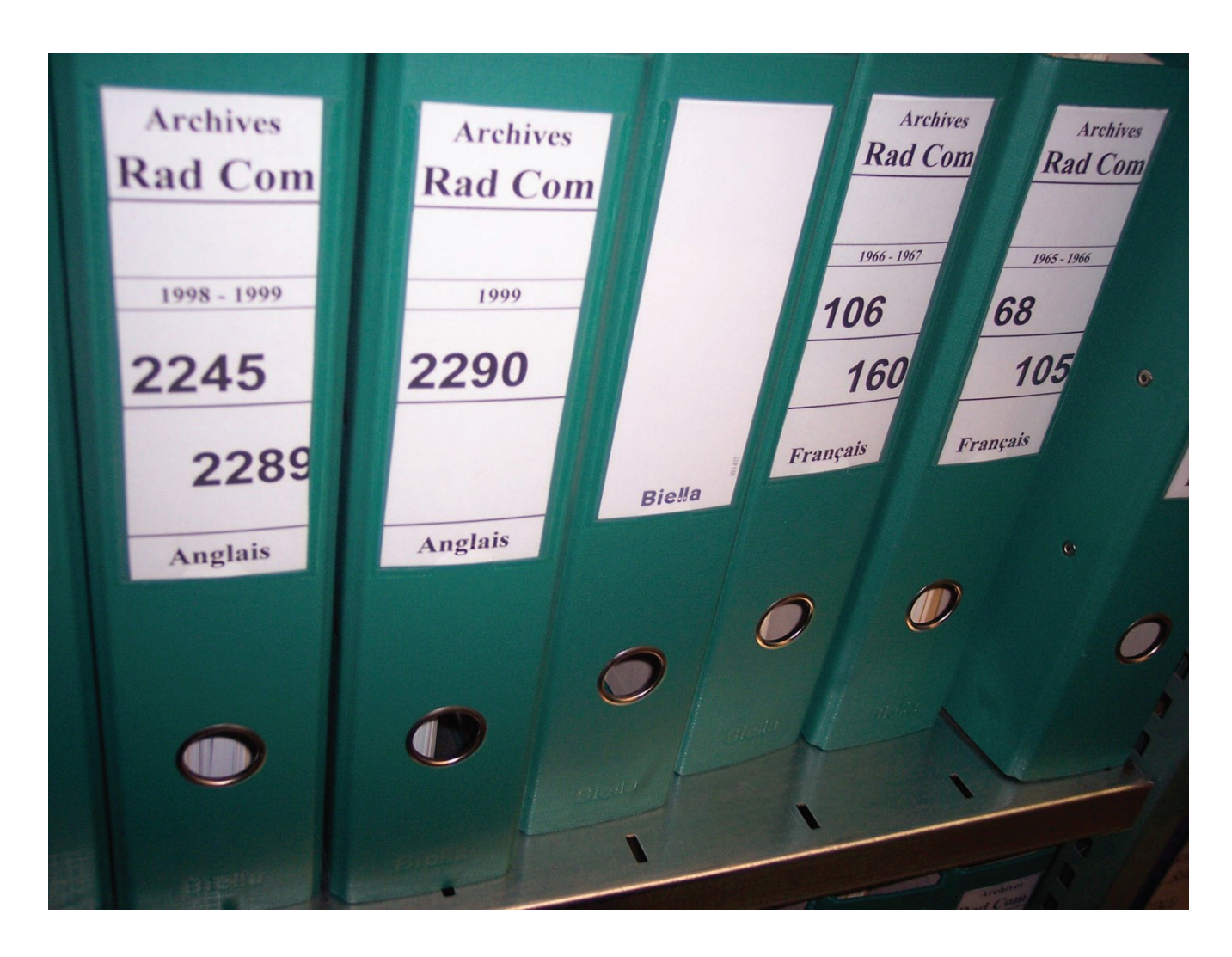
Figure 4. Files of the EBU Radio (Programme) Committee as the author found them in 2010. The two on the left are the end of the series of reports and meetings of the committee in English (labelled as such in French), which ran up to 1999, and then the parallel documents in French begin from the committee's founding in 1965.

Conversely, correspondence and meetings of individual committees could also extract and quote specific decisions of the governing bodies and reports [see Fig. 3].