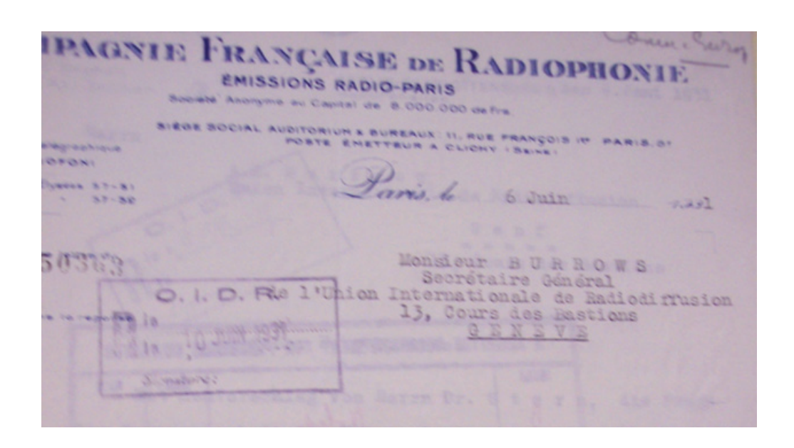
Figure 1. Correspondence with the IBU office in Geneva, June 1931; note the stamp of incoming correspondence at lower left.