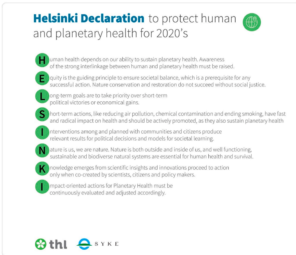
Fig. 2. The Helsinki Declaration emphasizes the urgency to act.

health care (van den Bosch and Ode Sang, 2017).