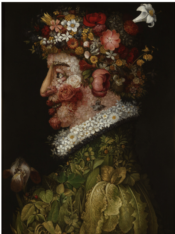
Figure 1. Portrait of a Mythical Figure Arising from Plant Leaves and Flowers: La Primavera by Giuseppe Arcimboldo, 1563, Real Academia de Bellas Artes de San Fernando, Madrid. Reproduced with permission.