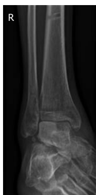
Figure 4 Radiograph of the ankle at follow-up, showing early signs of avascular talar necrosis.

Immediate reduction, extensive wound debridement and when necessary additional stabilisation are key features of treatment and should be performed as short after presentation as possible.