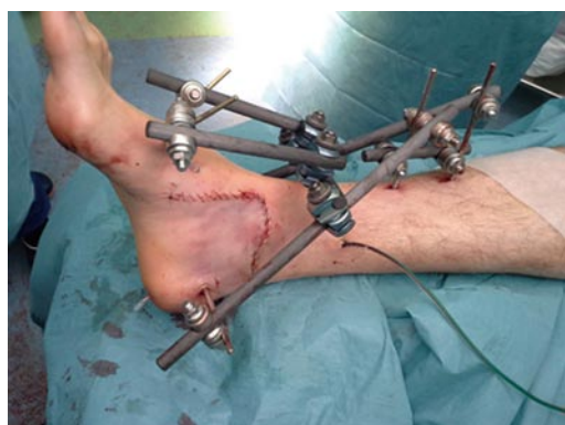
Figure 2 The wound is closed primarily after meticulous debridement and an external fixator is applied.

Eighty-seven percent of patients were male. Mean age was thirty-four years. Subtalar dislocations were evenly distributed over the left and right extremity. Thirty out of 50 patients suffered a complicated injury. Unfortunately Gustilo grading of complicated injury was not reported in all studies and therefore not available for analysis in this study. Associated fractures of the tarsal or metatarsal bones were present in seventeen patients, posterior tibial tendon rupture was present in six patients.