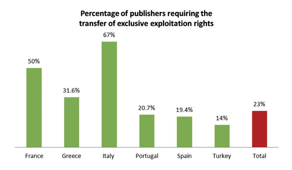
Fig. 2: Transfer of exclusive exploitation rights required by publishers.

All in all, the approximately one-quarter of Mediterranean publishers who require the transfer of exclusive exploitation rights to their press (Figure 2) turn out to be the resulting average out of 31.5% (6 out of 19) in Greece, 19.5% (21 out of 108) in Spain, 20% (6 out of 29) in Portugal, 50% (4 out of 8) in France, 67% (2 out of 3) in Italy and 14% (1 out of 7) in Turkey.