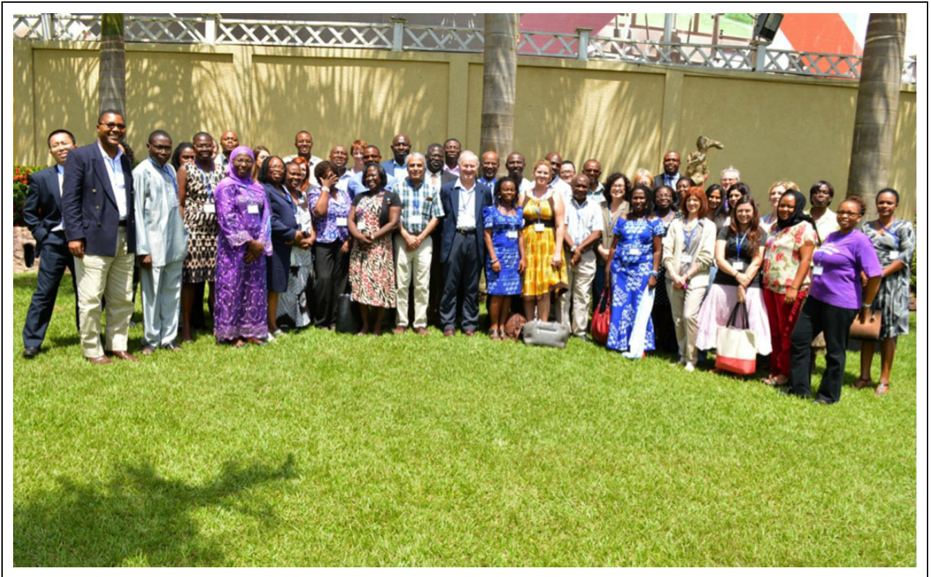
Figure 1. Portrait of delegates to autism in Africa meeting, Ghana, April 3-5, 2014.

disorder were invited to participate. Over 47 participants from 14 African countries attended (Figure 1, Table 1).